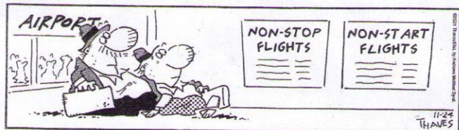
FRANK AND ERNEST | BOB THAVES